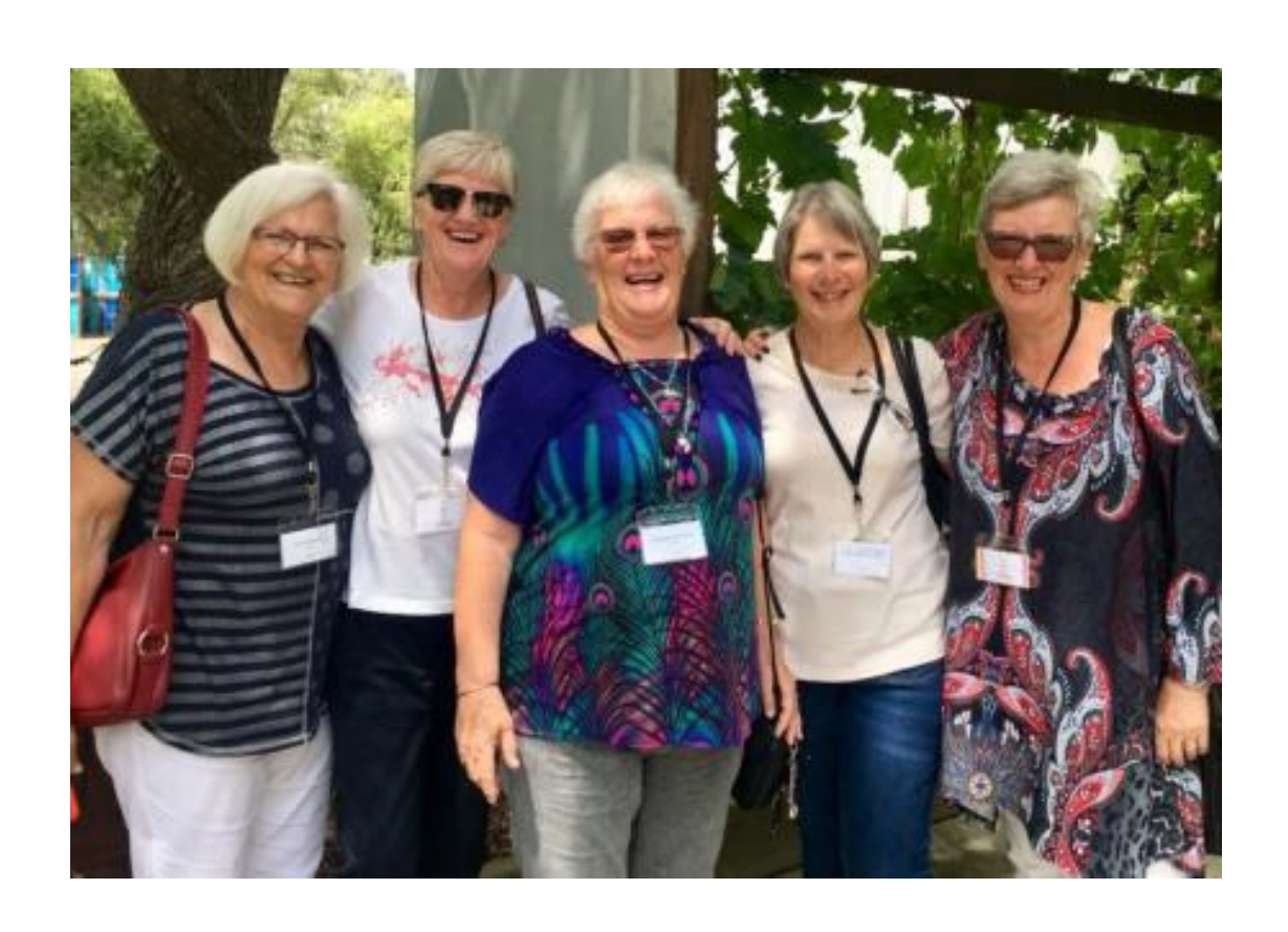
2018 WRANS-RAN Women's Reunion NSW – Hunter Region

Newsletter of the WRANS – Naval Women's Association (ACT)