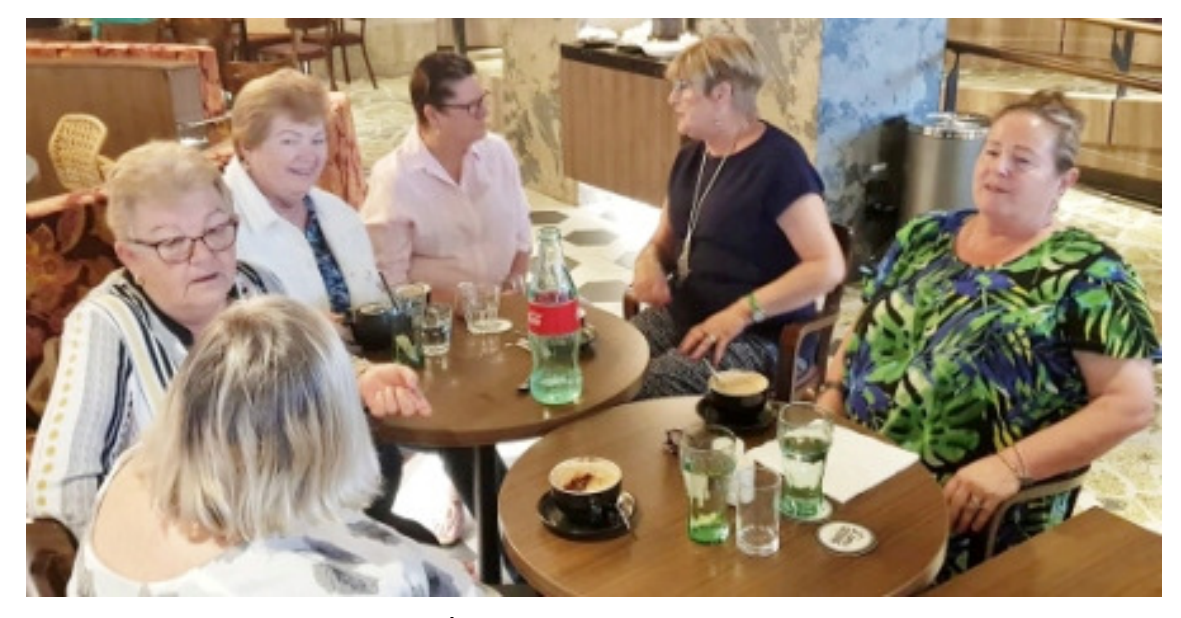
January - April - Happenings in WRANS ACT

Newsletter of the WRANS - Naval Women's Association (ACT)