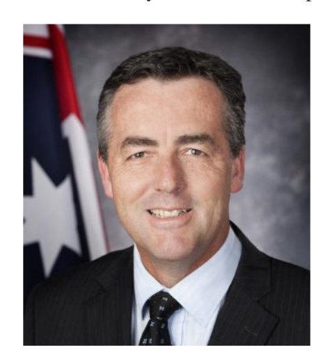
The Hon Darren Chester MP Minister for Veterans' Affairs, Minister for Defence Personnel

"You and your generation of WRANS showed Navy the way forward towards the modern integrated workforce in which every rank and career path is open to all our members," VADM Noonan wrote.