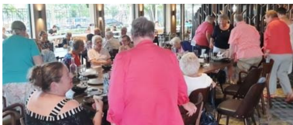
WRANS and WRENS milling for photo

On 21 February, the monthly lunch was held at the Ainslie football club. Everyone is welcome even if you only come for a coffee, we would like to hear your experiences. You never know who is going to attend.