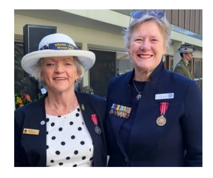
ANZAC Day March