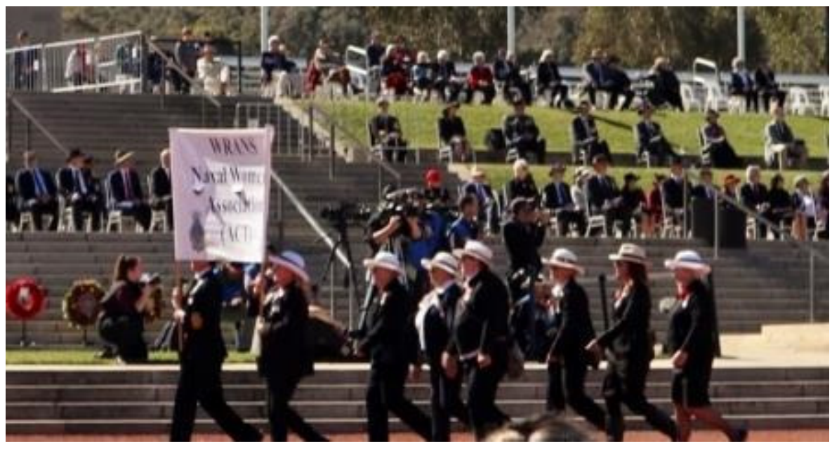
WRANS - Naval Women's Association (ACT) - Anzac Day 2021,